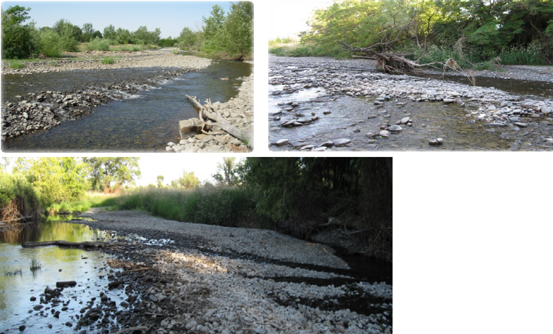
Figure 1. The following photos are examples of low-flow instream barriers that were encountered in dammed Pacific Northwest rivers.

It would be important to evaluate how many low-flow instream barriers would be created in Thjorsa River by the placement of the three hydro dams. To estimate the potential extent of these barriers a survey to measure the bathymetry of the river between and below the dams should be made. Then a physical model of the river could be built to determine how many and the location of all the low flow barriers to migration that are created. This evaluation would be a critical element in determining the overall impact of the dams to the salmon population productivity.